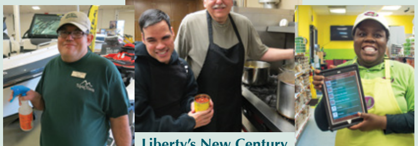
Liberty's New Century